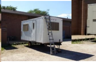
First Reunion Debut - 2014