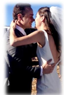
July 9, 2016