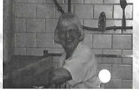
1996 Reunion Photographs by Dan DiCenzi (7)