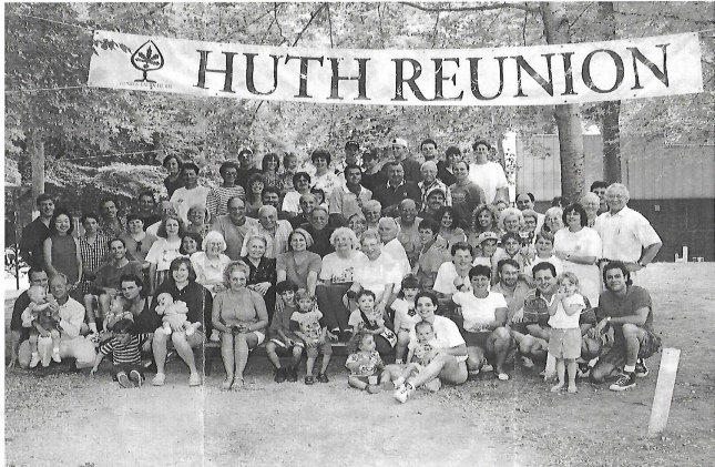
WELCOME BACK TO THE HUTH FAMILY REUNION 1997 "HUTH DEUTSCH FEST"