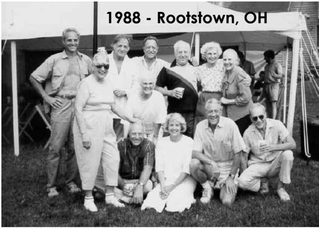
1988 - Rootstown, OH